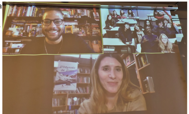
Photo taken with the class at the end of the interview