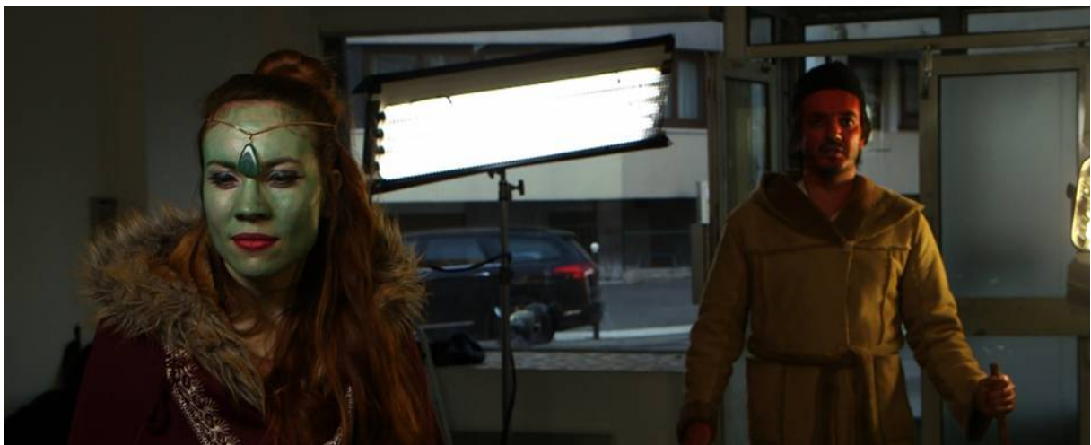
Short film Strange Curve - 2018

Finally the big final scene, when these two characters are freed from their geole, takes place first on a mountain path, then around a lake. Part of this lake scene will be filmed in the studio, on a green background. These sequences with the actors filmed on a green background will be "embedded" in post-production on images of the frozen lake, to which we will still add the plastic projections of shadows and lights that Guillaume, harnessed to his overhead projector, will create at this point.