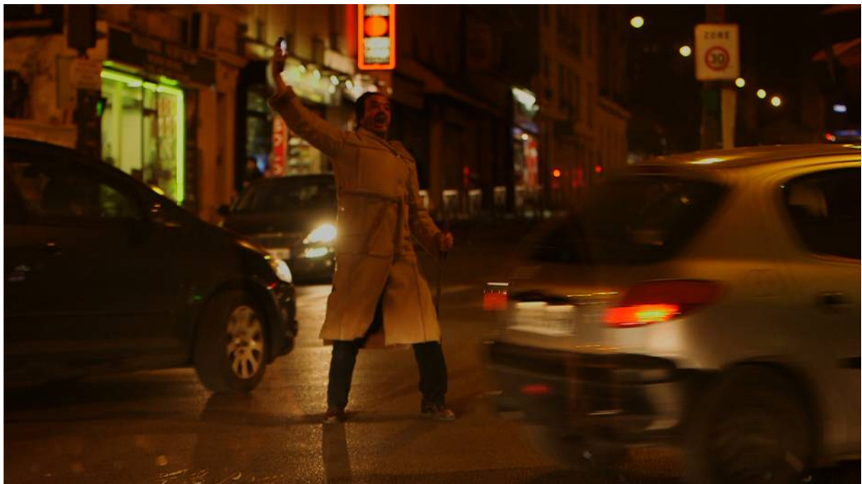
Short film Strange Curve - 2018

My project is to let the spectator find the key himself, it is to invite him on a journey of contemplation, a game of mysteries and hiding places. We are situated between mystery “thriller” and painting of a society, in a poetry which alternates, balances, does not give the solution but lets it be invented.