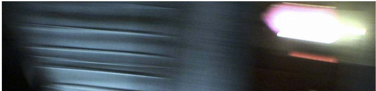
Short film 10 times nothing or the Morning Dissipations - 2016