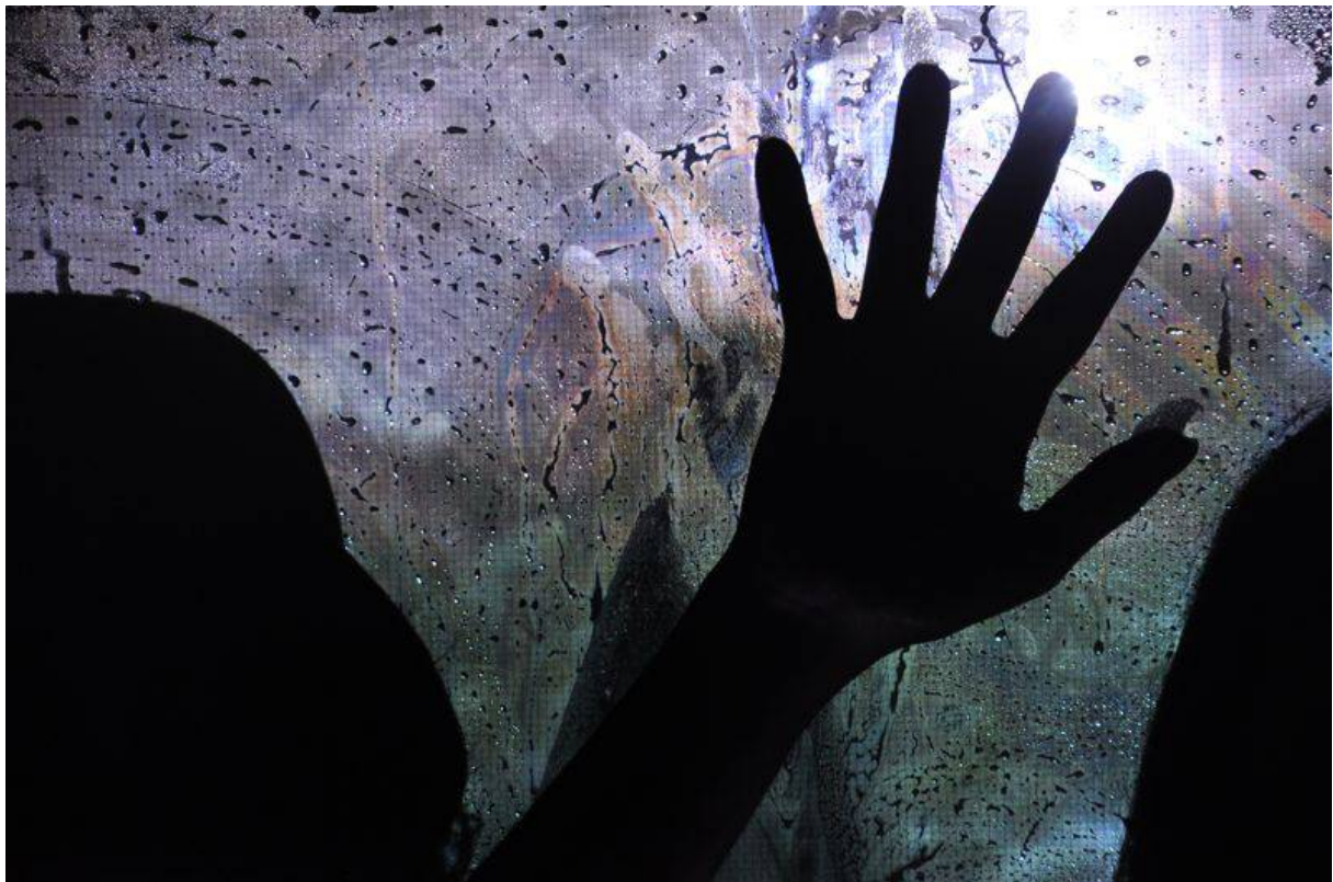
Short film Le Rubbant - 2015

Curriculum vitae : http://arnaud.romet.free.fr/films/bio-arnaud-romet.pdf