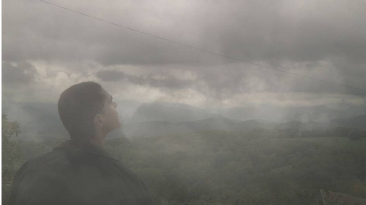
Short film Les Apparitions - 2019