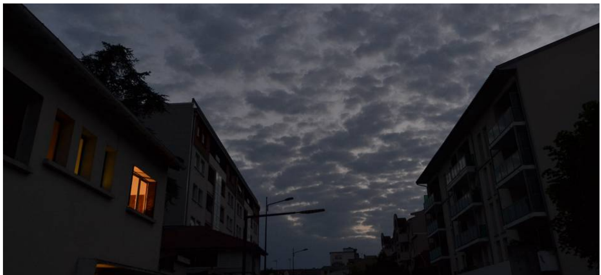
Short film 10 times nothing or the Morning Dissipations - 2016

Other positions to be filled: a lighting technician, a set designer, a stage manager, an actor director, an editor.