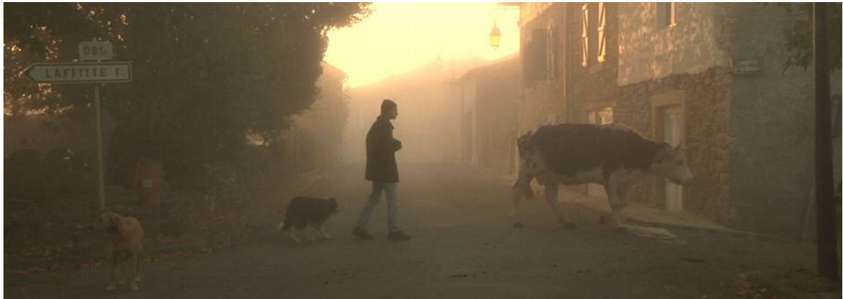
Short film The Apparitions - 2019