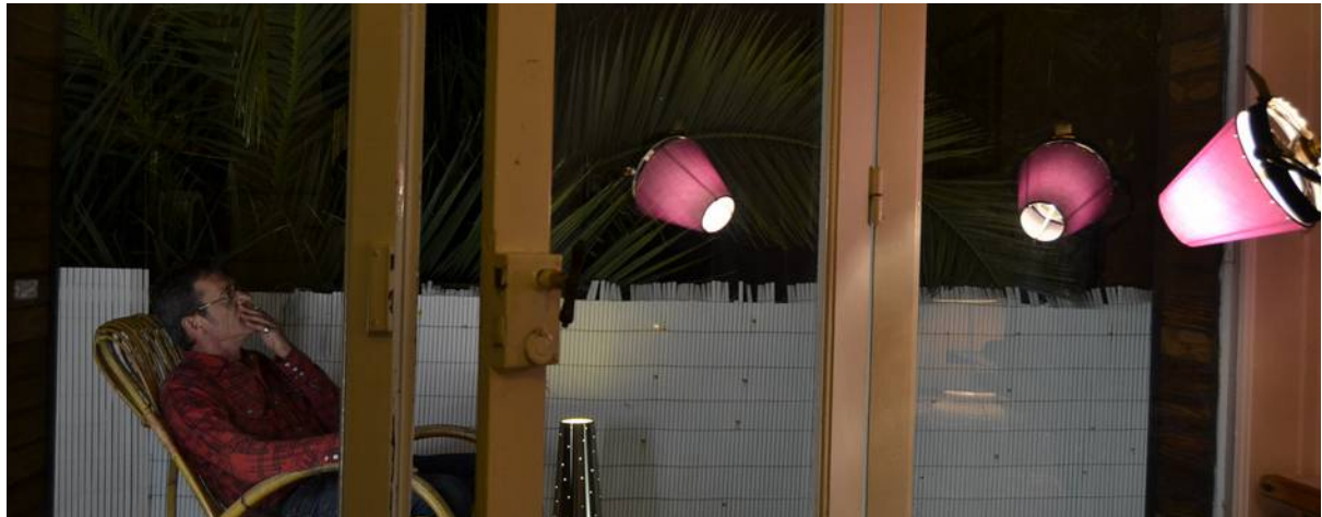
Short film 10 times nothing or the Morning Dissipations - 2016

I would like to create the film as an author-director, accompanied by a team of technicians including: 1 chief operator, 1 1st assistant, 1 sound engineer, 1 sound assistant, 1 lighting technician, 1 set designer, 1 stage manager, 1 script..