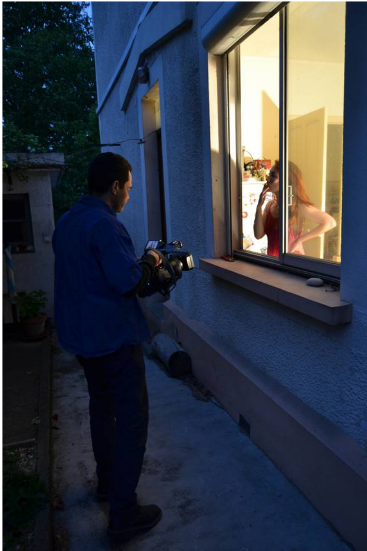
Short film 10 times nothing or the Morning Dissipations - 2016

As an editor , because I think, even if I hope to entrust the editing to a professional, to be present in the image editing, and to be very involved in the sound editing.