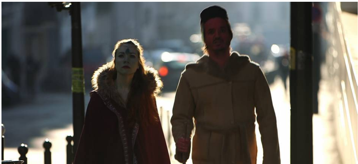
Short film Strange Curve - 2018

My goal is to manage to realize a convincing film, which seduces a large audience and offers them the pleasure of an original “show”, well done, in a shared jubilation.