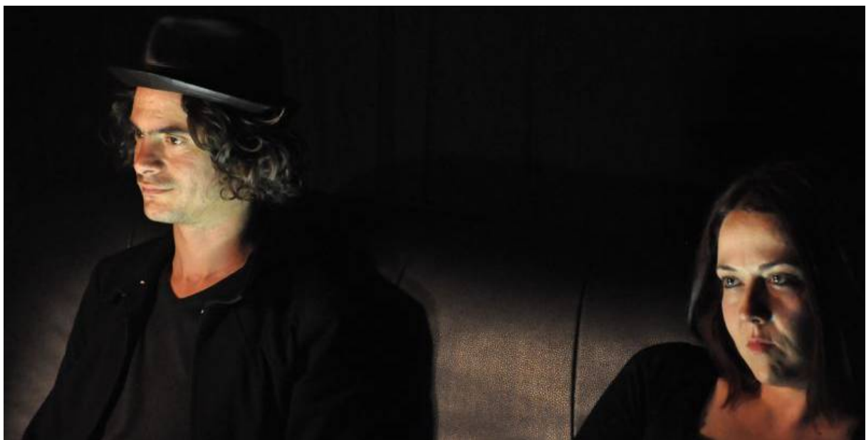
Short film Le Rubbant - 2015

I stay on the edge, I don't go completely into the fantastic or the dreamlike. All these appearances these obsessions are only the fantasies of Guillaume that will shake up his life, until a final resolution where he goes through the mirror to find the solution and free himself from the two individuals who obsess him.