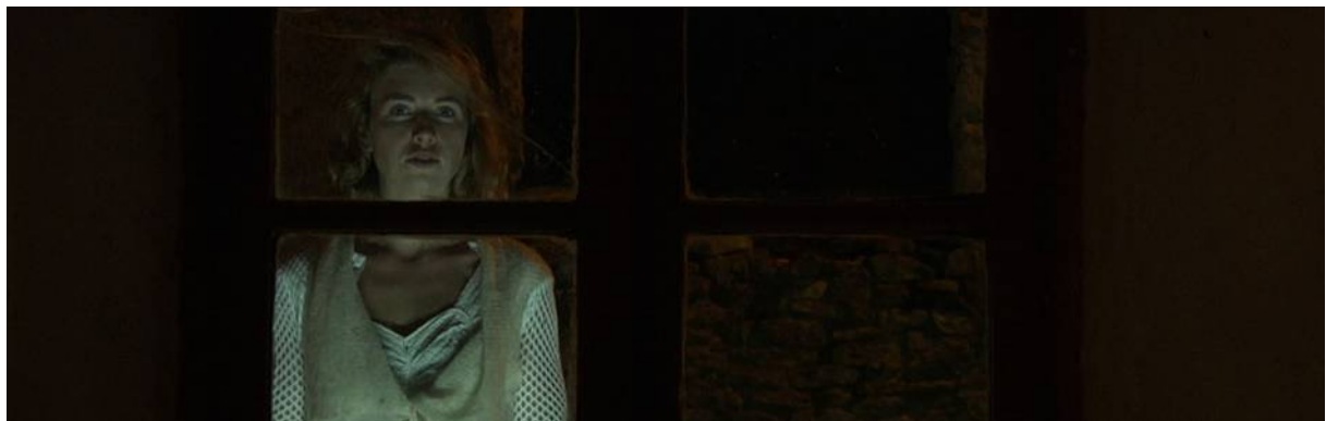
Short film The Apparitions - 2019

And if it simply was a metaphor of myself becoming a filmmaker?